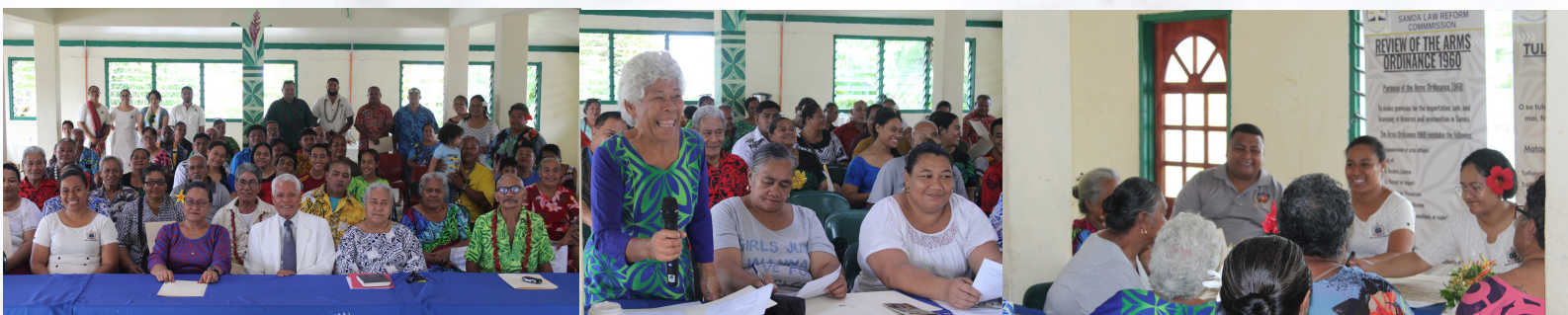
Public Consultation on the Review of the Arms Ordinance 1960,, 29 November 2023, EFKS Hall, Faleula