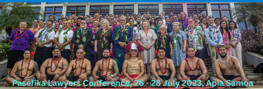
Pasefika Lawyers Conference, 26 - 28 July 2023, Apia Samoa