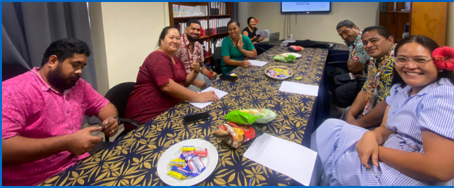
Father's Day Celebration, 11 August 2023