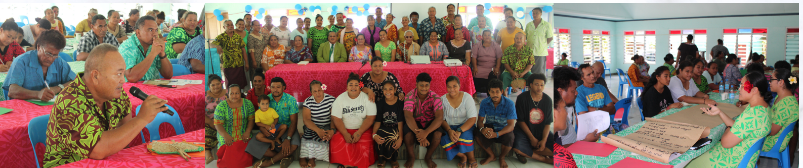
Public Consultation on the Review of the Arms Ordinance 1960, 8 December 2023, EFKS Hall, Saleaumua Aleipata