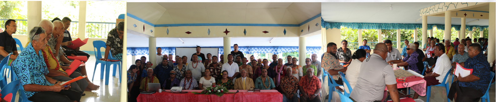
Public Consultation on the Review of the Arms Ordinance 1960, 6 December 2023, EFKS Hall, Saleilua Falealili