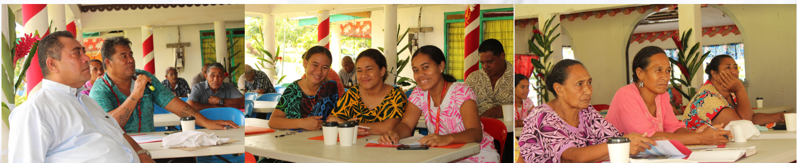
Public Consultation on the Review of the Arms Ordinance 1960, 4 December 2023, Methodist Hall, Tafagamanu Lefaga