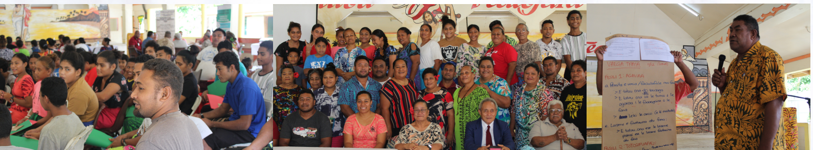
Public Consultation on the Review of the Arms Ordinance 1960, 11 December 2023, EFKS Hall, Lona Fagaloa