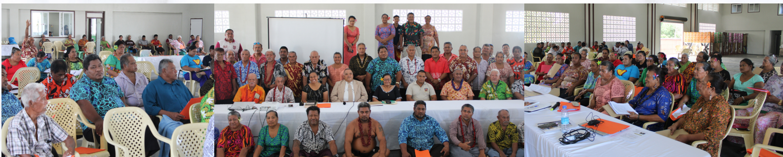
Public Consultation on the Review of the Arms Ordinance 1960, 30 November 2023, EFKS Fasitoo-tai,