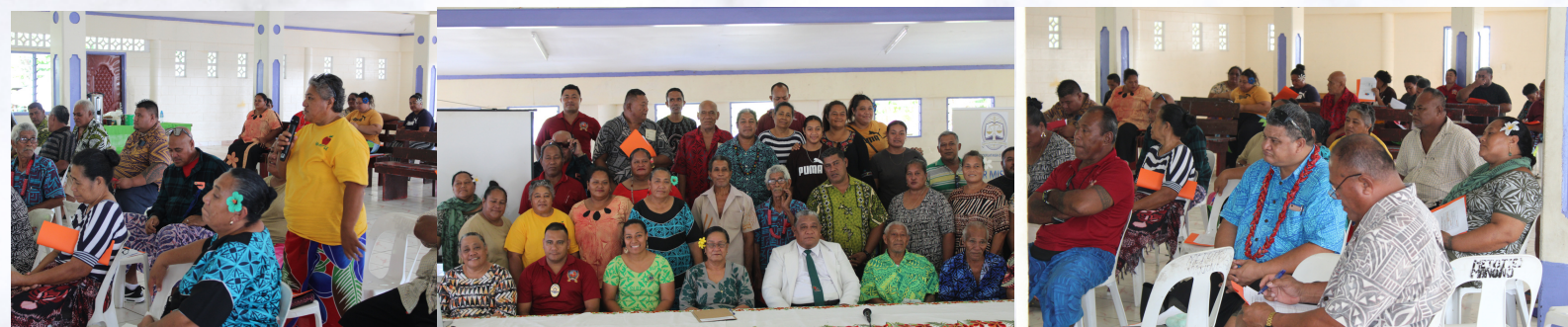
Public Consultation on the Review of the Arms Ordinance 1960, 1 December 2023, Methodist Hall, Manono-uta