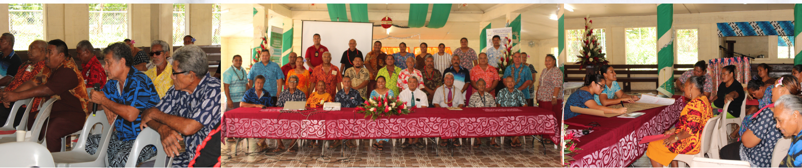
Public Consultation on the Review of the Arms Ordinance 1960, 5 December 2023, EFKS Hall, Saanapu