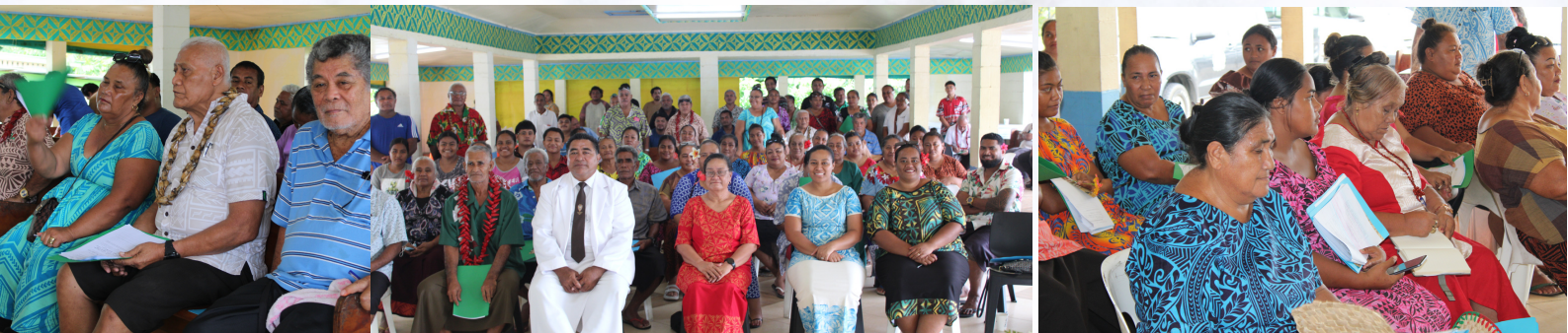
Public Consultation on the Review of the Arms Ordinance 1960, 12 December 2023, EFKS Hall, Leusali