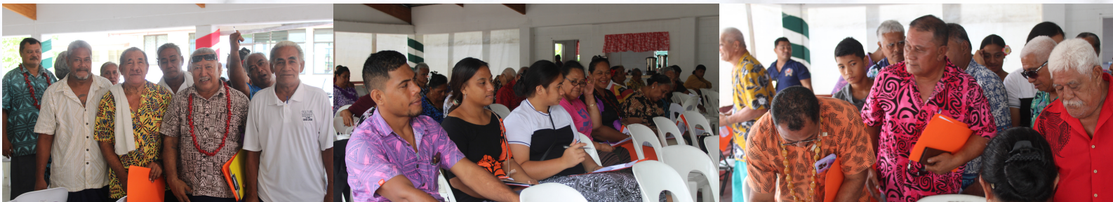
Public Consultation on the Review of the Arms Ordinance 1960, 28 November 2023, Methodist Hall, Vaitele-uta