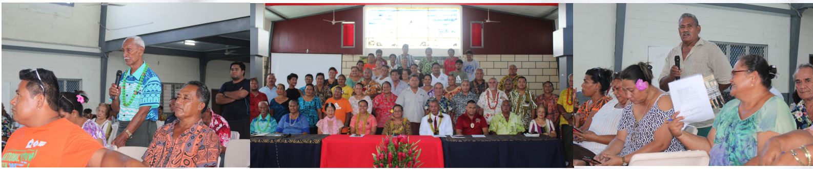
Public Consultation on the Review of the Arms Ordinance 1960, 27 November 2023, Tuutuileloloto Hall, Mulivai