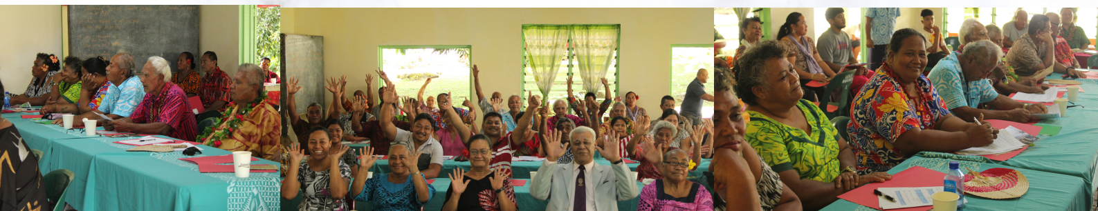
Public Consultation on the Review of the Arms Ordinance 1960, 7 December 2023, EFKS Hall, Aufaga